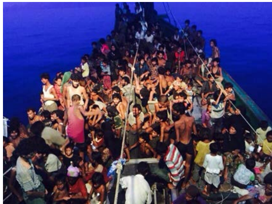
↑ A boat crammed with some 350 people, believed to be from Myanmar or Bangladesh, including Rohingya, found drifting off the coast of Thailand and Malaysia in May 2015. They had been at sea for “many days”, possibly more than two months

For several decades, discrimination, violence and human rights abuse by state and non-state actors have led hundreds of thousands of Rohingya to leave the country and to seek refuge elsewhere. 82 The situation of the Rohingya has continued to deteriorate as a result of state measures to deepen their exclusion. For example, in 2015 the Myanmar authorities revoked all temporary registration cards (known as “white cards”), a move that prevented former holders of these cards – many of them Rohingya – from voting in the November 2015 election. 83