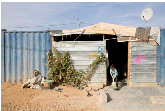
↑ A little girl cleans. Zaatari refugee camp, North Eastern Jordan, November 2014 © Amnesty International (Photo: Richard Burton)

Rukban and Hadalat – in October 2015 and the numbers have increased steadily since then. Jordan previously allowed humanitarian agencies to provide assistance to the refugees at the berm but following the attack and the complete sealing of the border, only one food aid delivery was made, in early August. 37 Lack of access to regular supplies of water, food, health care and other assistance has led to a number of deaths in this area.