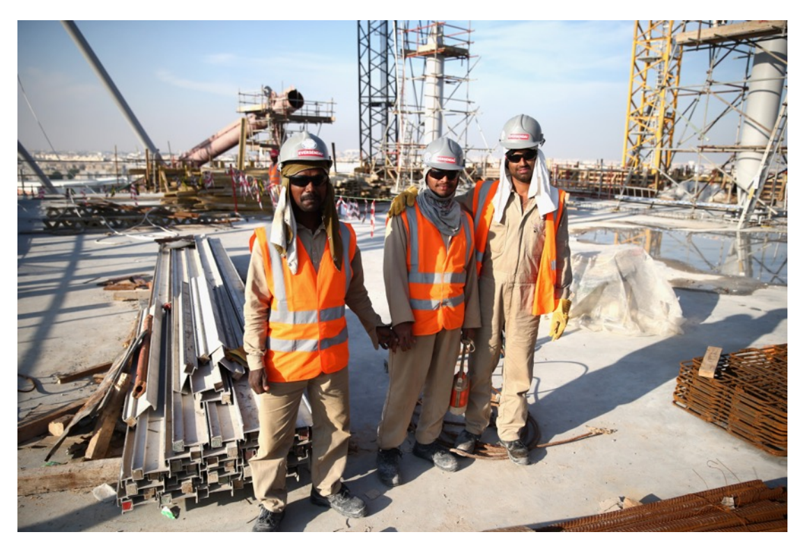
Construction workers in Doha, Qatar, 30 December 2015.

Migrant workers are still unable to form and join trade unions in Qatar, and Joint Committees formed and led by employers, cover only 2% of the workforce. While providing workers with some representation, these remain beset with serious flaws, lacking mechanisms for collective bargaining and failing to provide workers with crucial legal protections. The government must respect its international obligations and allow migrant workers to form and join independent trade unions.