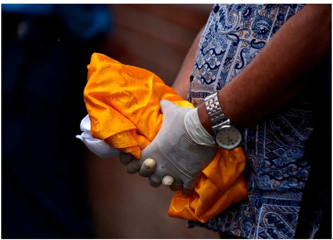
A Family member arrives at Tribhuvan International Airport to take a relative's deceased body for the final ritual in Kathmandu, Nepal on Friday, June 19, 2020.

Migrant workers continue to face major challenges to receive justice and remedy for a range of abuses despite new mechanisms introduced. New Labour Committees increased the number of workers successfully resolving complaints of wage theft but remain beset with shortcomings and delays. A compensation fund has also started to pay out significant amounts to workers offering them much needed relief but is not accessible to all and the amounts paid out have been capped. Qatar must increase the number of judges, accept collective, historic and remote claims and ensure the fund reimburses workers their full dues. It should also ensure migrant workers can access remedy for non-wage related abuses.