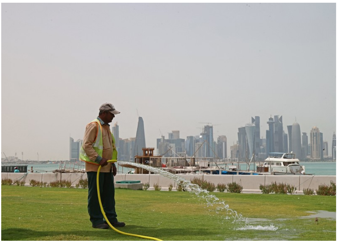
A worker waters the grass in the Qatari capital Doha, on May 5, 2022.

Many migrant workers in Qatar continue to be subjected by their employers to conditions that amount to forced labour, including those in private security or domestic work. This includes workers being repeatedly denied their rest days and forced to work under the threat of financial penalties, having their salaries arbitrarily deducted and sometimes their passports confiscated. Yet despite the severity of this abuse the government continues to take insufficient action. Qatar should train inspectors to detect forced labour practices, investigate such cases to hold abusive employers to account, and remedy victims.