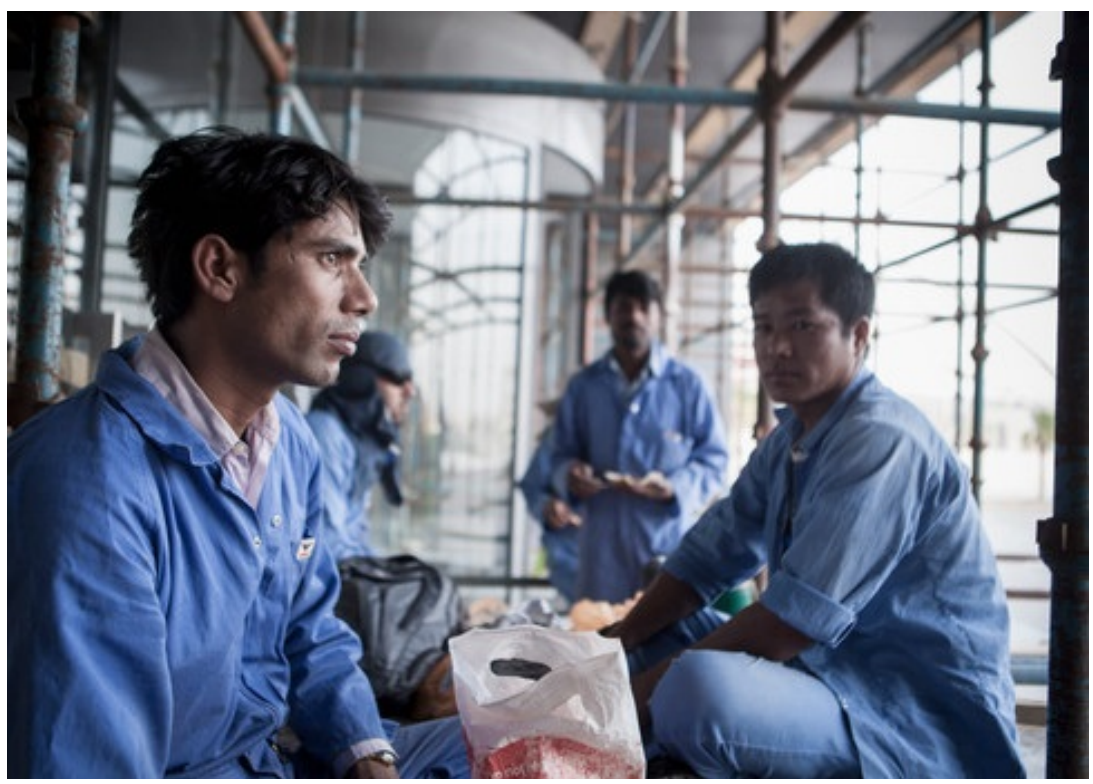
Migrant workers pause to eat at the Sports City area of Doha, Qatar.

A new minimum wage came into force in 2020. Nonetheless, wages in Qatar not only remain low for many migrant workers but are sometimes delayed or not paid at all. This has severe consequences for workers and their families, preventing them from escaping debts incurred from paying recruitment fees, and often trapping them in cycles of abuse and exploitation. A number of initiatives since 2015 have attempted to identify and prevent wage theft, but the issue continues on a significant scale. The authorities should increase and review the minimum wage, strengthen wage protection, and outlaw discriminatory practices of paying different salaries to different nationalities.