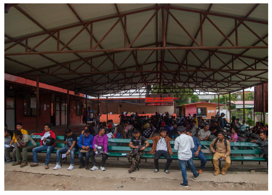
Nepali men wait outside the Foreign Employment Office at Tribhuvan International Airport, in the capital of Nepal, Kathmandu. Many will be prospective migrant workers, bound for the Gulf.

The payment by prospective migrant workers of recruitment fees to secure jobs in Qatar remains rampant, despite Qatar's commitment to tackle the problem. Paying between US$1,000 and US$3,000 in recruitment fees, many workers need months or even years to repay this debt, trapping them in cycles of exploitation and making it difficult for them to challenge or escape abusive employers. Qatar Visa Centres have streamlined the recruitment process in some countries but are not set up to effectively tackle the payment of illegal recruitment fees. The government must work with origin countries to combat such practice and reimburse migrant workers who paid for their jobs in Qatar.