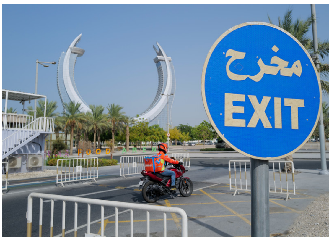
A food delivery worker leaves the Marina Food Area in Lusail City in Doha Qatar, 15 June 2022.

Crucial changes to the inherently abusive kafala sponsorship system mean the vast majority of migrant workers are now legally able to leave the country and change jobs without their employer's permission. While many workers appear to have been able to benefit from these changes in practice, key elements of the system remain in place and continue to trap many migrant workers in exploitative situations, at the mercy of abusive employers. Qatar must remove all these remaining legal and practical barriers, such as the charge of 'absconding', and penalize employers who use such practices as tools of control.