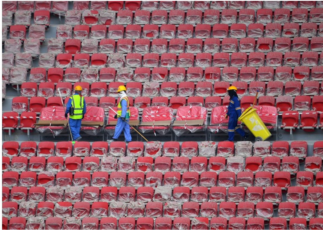
Construction workers in the stands of Qatar's new al-Bayt Stadium in the capital Doha, which will host matches of the FIFA World Cup 2022.

The Workers' Welfare Standards (the Standards) have improved the living and working conditions of thousands of migrant workers falling under the purview of the Supreme Committee, the Qatari body overseeing delivery of the World Cup stadiums. However, some major outstanding issues remain around the extent of enforcement and the small proportion of workers in Qatar covered by the Standards. In addition to strengthening labour laws and enforcement mechanisms, Qatar should learn from and strengthen the Standards and their enforcement, with a view to expand their coverage to more migrant workers across the country.