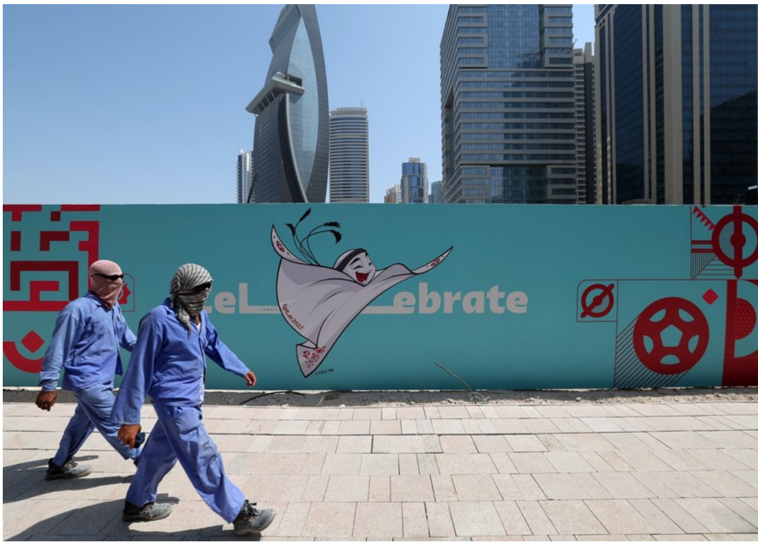
Workers walk past a billboard showing an illustration of the Qatar 2022 FIFA World Cup mascot "La'eeb" in the Qatari capital Doha on October 13, 2022.